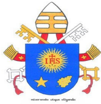
Pope Francis Rome, Italy

Visit us at: www.saintann-somerville.org