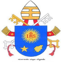
Pope Francis Rome, Italy