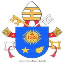
Pope Francis Rome, Italy